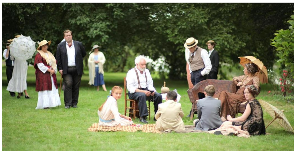
Garden Party (with Waterbeach Players as extras)