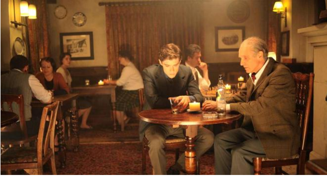
The Bridge Pub (several of the staff appeared as extras)